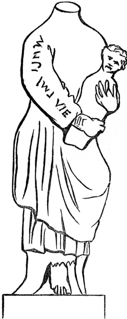
Etruscan goddess and son