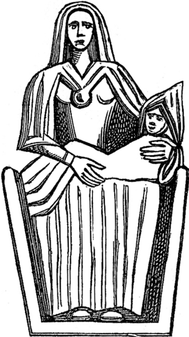
Greek goddess - and son