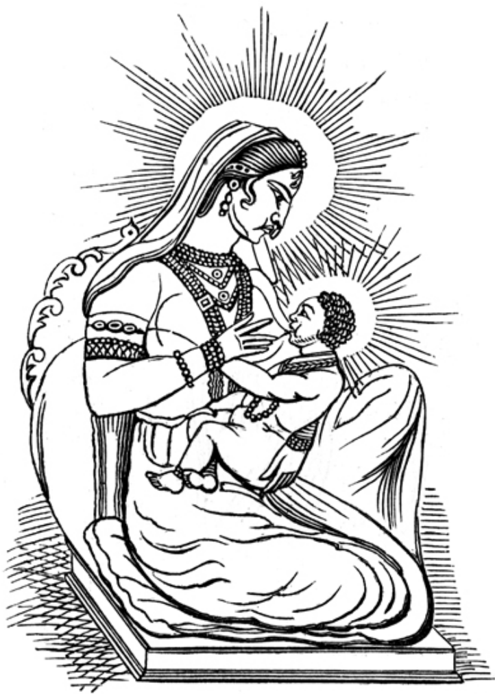
Hindu goddess and son