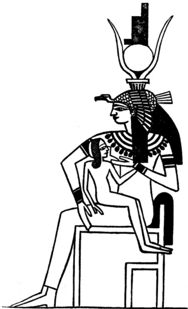
Egypt goddess - Isis and Horus