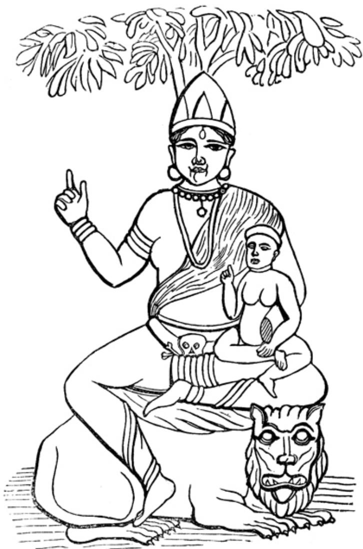
Babylon goddess and son