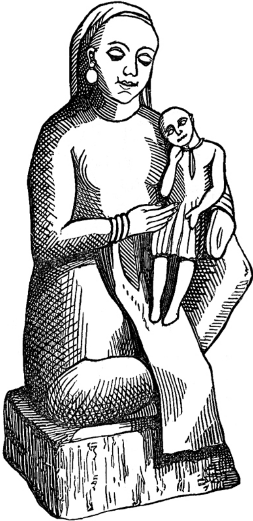
Ancient goddess and son